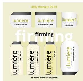
daily thérapie 90 repairing, firming & vitalizing kits