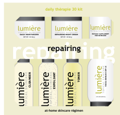
daily thérapie 30 repairing & firming kits